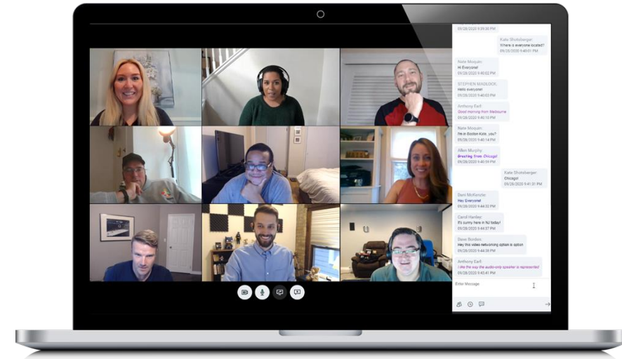
Scheduled Breakout Rooms