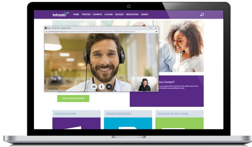
1:1 Video Chat